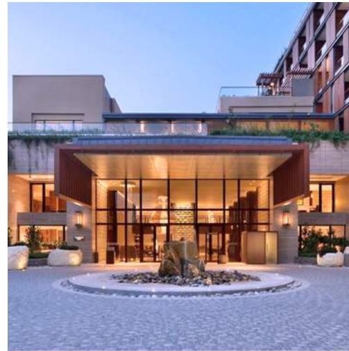
The Westin Resort & Spa