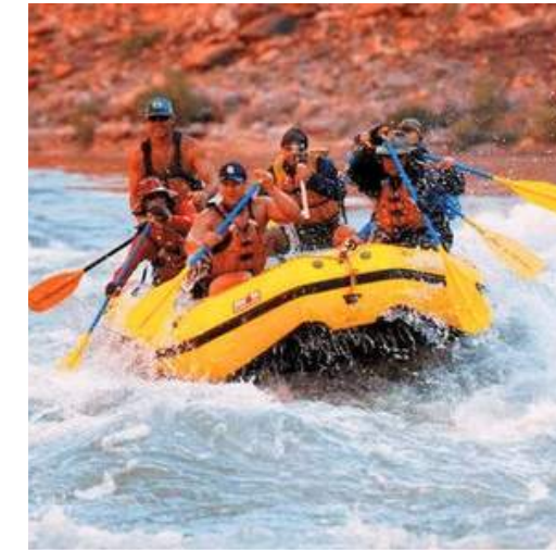
Rafting Point Shivpuri