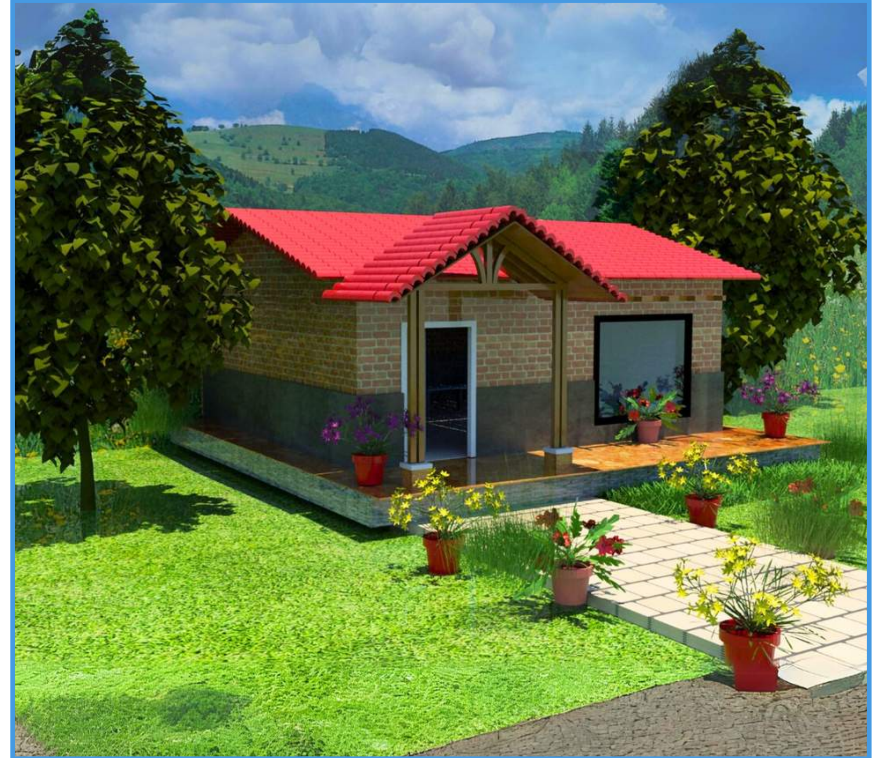
INTERIOR & EXTERIOR