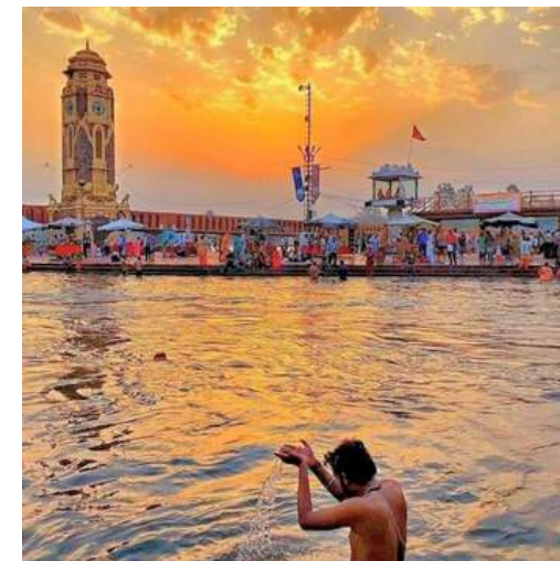
Ganga Ji River