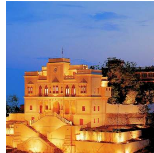
Ananda Resort & Spa