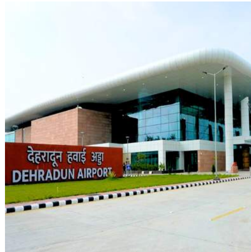
Jolly Grant Airport